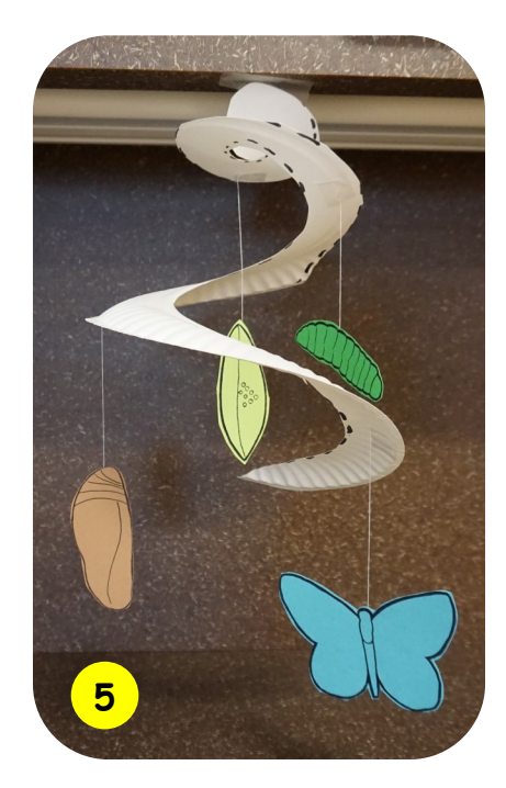
Step 5: Tape or tie your mobile somewhere it can hang down and spin freely. Enjoy your new piece of science-inspired art!

Starting near the center, attach in this order: leaf, caterpillar, chrysalis, butterfly.